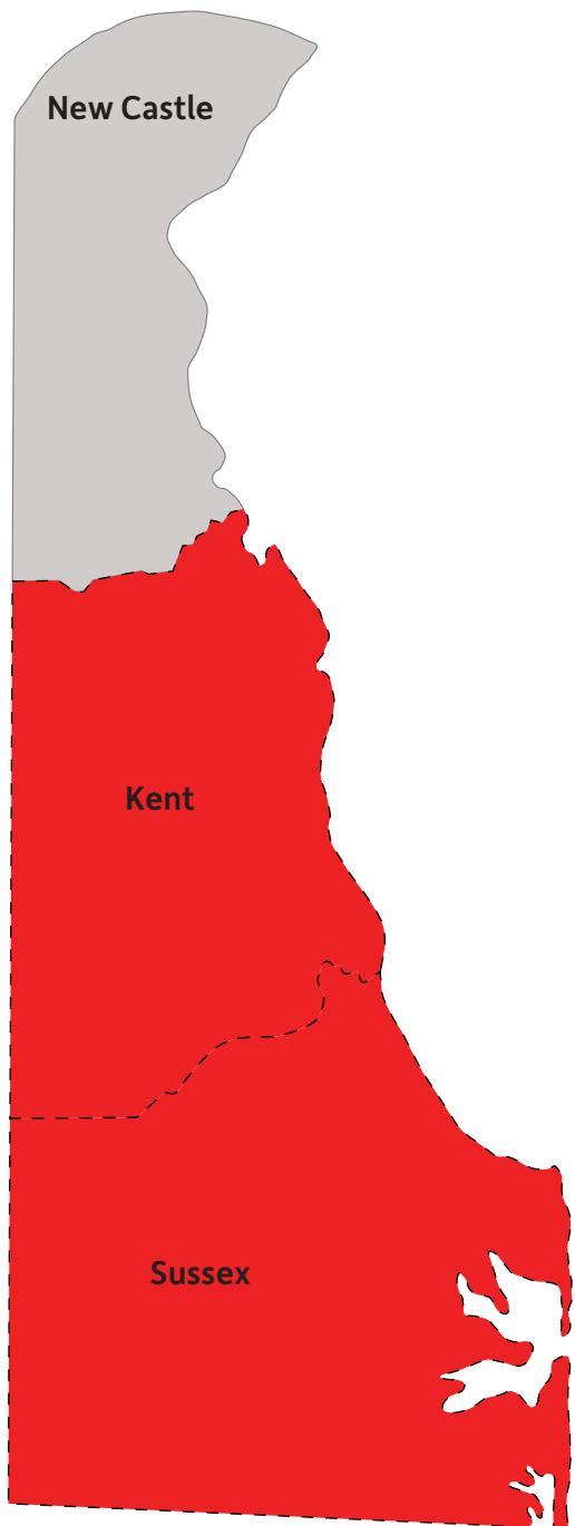
Delaware Judicial Profile by County